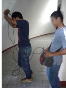
Figure 1: UPV test

Ultrasonic pulse velocity (UPV) test is intended for observing the uniformity of existing concrete and existency of cracks. Indirect method was applied (Fig. 1) The UPV test were carried out at five location to observe dome concrete crack region.