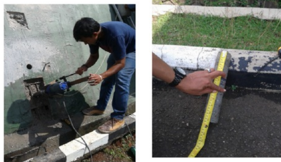
Figure 2: Core Drilling

Core drilling (Fig.2.) is intended for obtaining specimen out of existing concrete was before test in laboratory to find compression strength of concrete. The size of specimen cylinder is 200 mm height and 100 mm diameter. Coring is performed along the dome around 8 points with a height variation of 50 mm and 100 mm from the dome base.