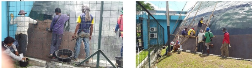
Figure 5: Instalment of CFRP to Strengthening Dome

Based on the safety factor, therefore, 3.8m was attached. The installment of the repairment is shown in Figure 5.