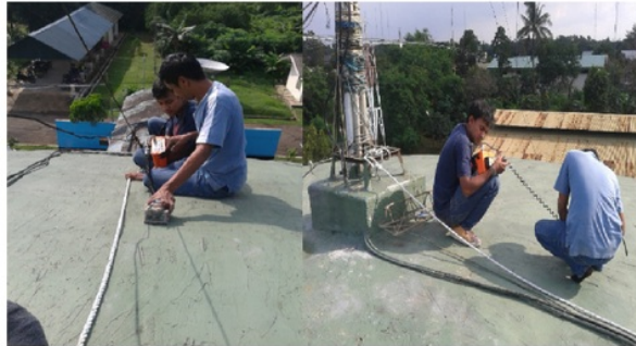
Figure 3: Profometer Testing