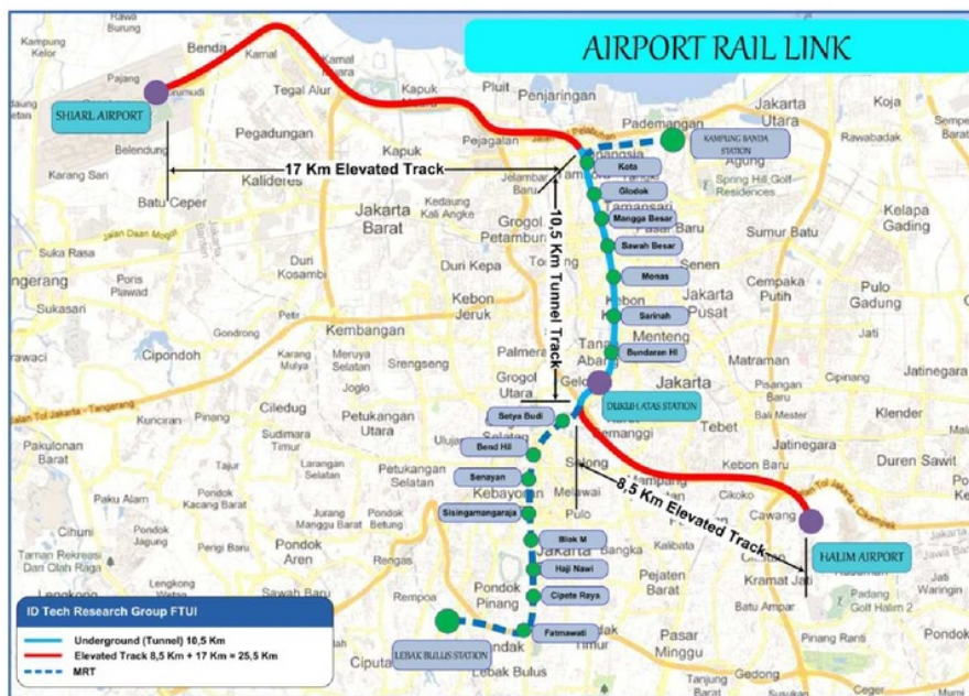
Figure 3. Route of the SHIARL Project